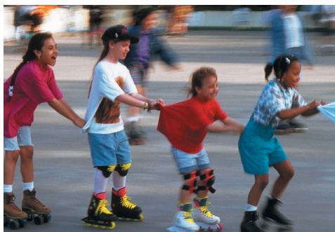
Children active outdoors can be sensitive to some air pollutants.

In large cities (more than 350,000 people), state and local agencies are required to report the AQI to the public daily. When the AQI is above 100, agencies must also report which groups, such as children or people with asthma or heart disease, may be sensitive to the specific pollutant. If two or more pollutants have AQI values above 100 on a given day, agencies must report all the groups that are sensitive to those pollutants. Many smaller communities also report the AQI as a public health service.