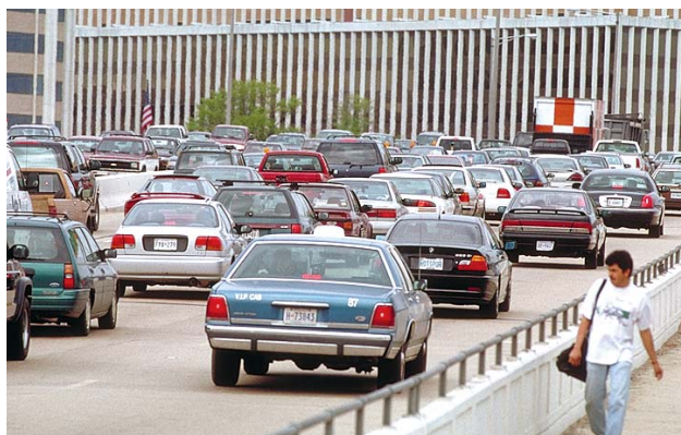
Vehicle exhaust contributes roughly 60 percent of all carbon monoxide emissions nationwide.