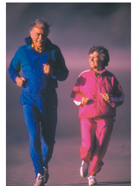
Air quality directly affects our quality of life.

The AQI is an index for reporting daily air quality. It tells you how clean or polluted your air is, and what associated health effects might be a concern for you. The AQI focuses on health effects you may experience within a few hours or days after breathing polluted air. EPA calculates the AQI for five major air pollutants regulated by the Clean Air Act: ground-level ozone, particle pollution (also known as particulate matter), carbon monoxide, sulfur dioxide, and nitrogen dioxide. For each of these pollutants, EPA has established national air quality standards to protect public health.